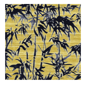
Talamone Terra promessa wallpaper, £214 per roll, Elitis