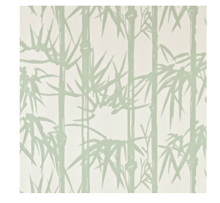
Bamboo BP 2139 wallpaper, £97 per roll, Farrow & Ball