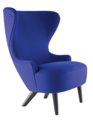
Top Micro Wingback chair copper leg Hallingdal 65, £2,000. Bottom Micro Wingback chair black leg Hallingdal 65, £1,700, both H100xW74xD73.8cm, from Tom Dixon