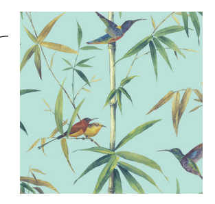
Global Fusion G56411 wallpaper, £29.95 per roll, Galerie Wallcoverings

Bring a touch of the tropics to your walls and decorate with paper printed with the sturdy stems and delicate leaves of bamboo >